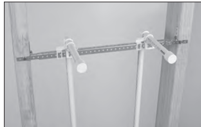
Use Edge Clamps with galvanized models.