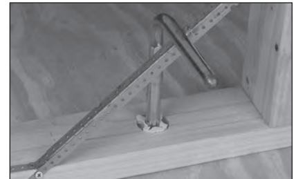
Solder copper tube directly to copper-plated models.